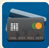
Credit Card Fees