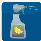
Cleaning and Hygiene Supplies