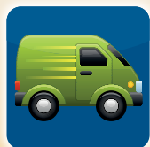
Parcel Courier Services