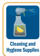
Cleaning and Hygiene Supplies

Our specialist experts cover PDQ machine rental and merchant bank fees and are independent of the end providers.